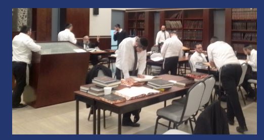
Internal study session at the Kollel

Non-Profit Org US Postage PAID Denver CO Permit #904