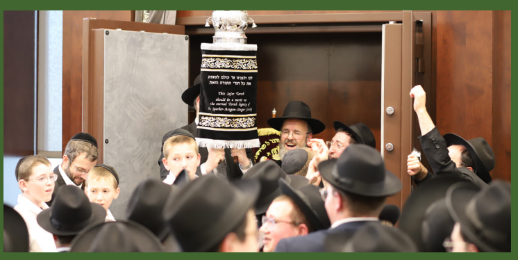
Bringing the new Torah into its home