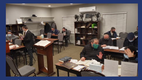
Night Seder at Southeast Kollel Torah Center