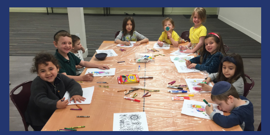
Preschool summer camp in Kollel Youth Center