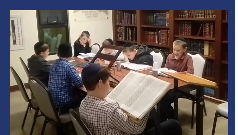
Boys learning at Night Seder in West Denver Kollel Torah Center