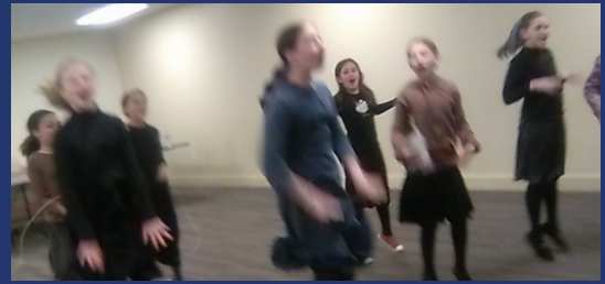
Dance class at Kollel Youth Center