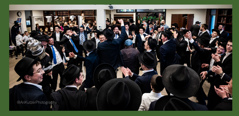
Dancing at the Kollel West Denver Bais Medrash