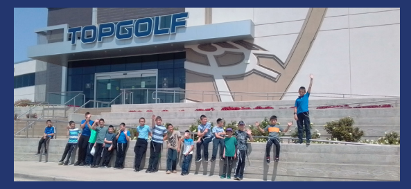
West Side Avos Ubanim trip to Top Golf