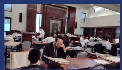
West Denver Kollel Torah Center during summer break