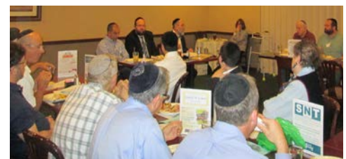
The T4T class engendered much discussion among the participants and presenters