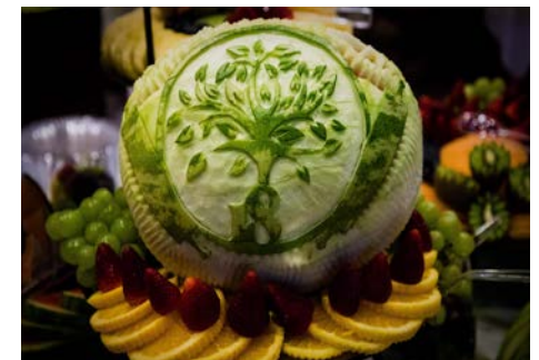
Delectable and elegant Fruit-Inspired Cuisine