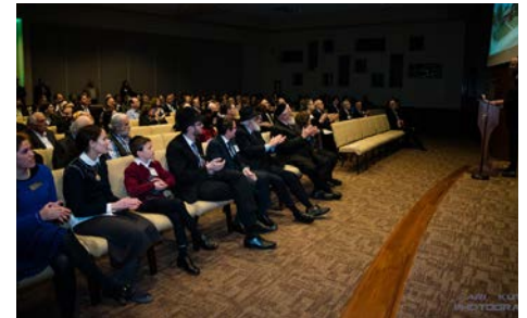
Partial view of the crowd during the Celebration program