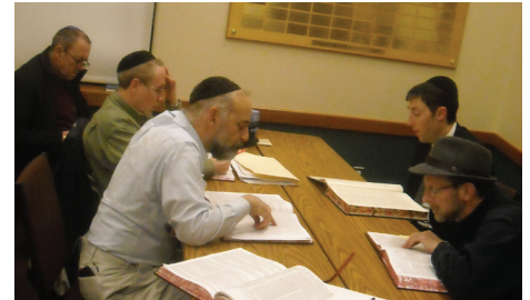
Engrossed in a section of the Talmud.