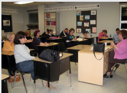
The Bais Yaakov for Adults Jewish History Series provided insight into the past - and the present.

"Above all, I was especially moved by [community members'] eagerness to advance in Torah learning and Avodas Hashem , service of G-d," he said. ❧